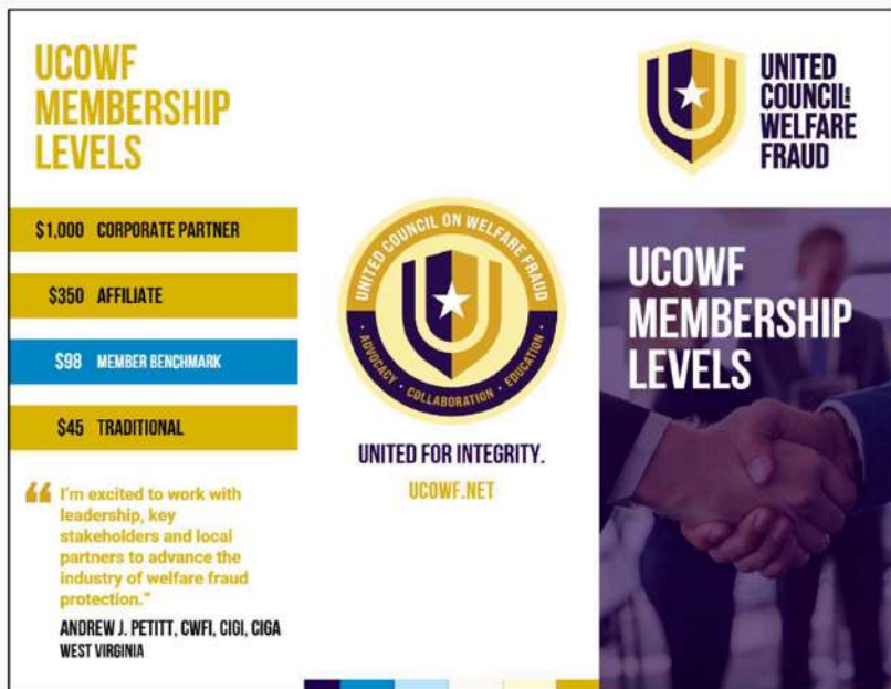
Pictured: UCOWF Membership Brochure

UCOWF's Board of Directors has worked hard to revamp and reevaluate our member tier system. After some changes to the structure in the last few years, the Board found a way to best reach our target audiences of membership.